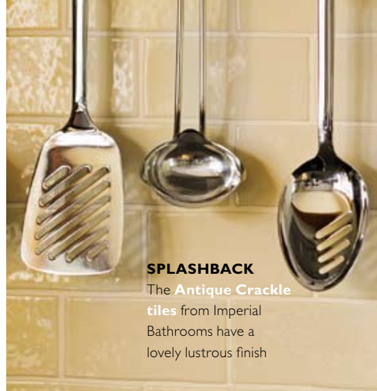
SPLASHBACK The Antique Crackle tiles from Imperial Bathrooms have a lovely lustrous finish